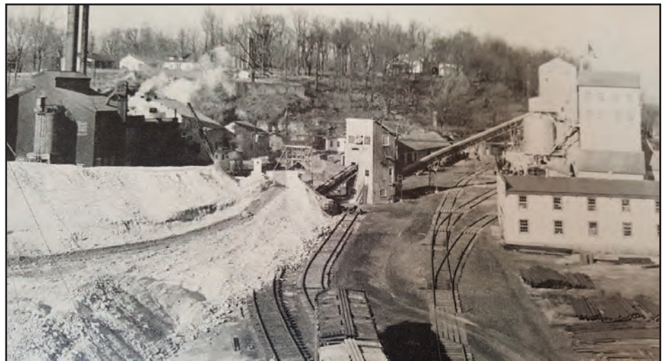
The Aluminum Ore Company of Rosiclare is shown in the early 1940s. White heaps of fluorspar are on the ground at left in front of the power house. Milling and crushing took place in the light colored building in the center, with additional cleaning and drying facilities in the buildings on the right.

years because most Kentucky fluorspar was in vertical veins. In contrast, some Illinois fluorspar in the Cave in Rock area had formed in easier-to-access horizontal or “bedded” deposits. These had occurred long ago when the hot fluoride-bearing solutions had encountered obstacles that caused them to move laterally and mix with limestone. Many of these horizontal deposits could be easily mined with the use of large, motorized vehicles to drill, load, and haul.