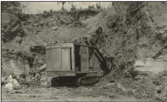
At Spar Hill, personnel from the Benzon Fluorspar Company use a shovel to remove fluorspar’s “overburden,” the dirt and rocks covering it. The photo was taken in eastern Hardin County about 1935.

Big-time mining began after World War I, during which fluorspar’s military applications had become clear. The United States had access to fluorspar in small amounts in several states, but the largest and easiest-to-mine deposits were in fluorspar-rich Hardin County and nearby counties such as Pope.