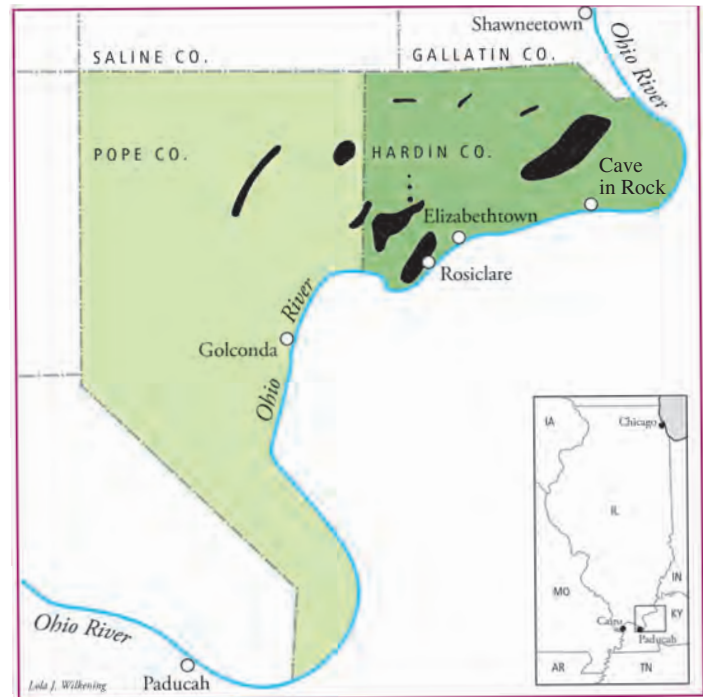
Shown in black, major deposits of Illinois fluorspar are located in the counties of Hardin and Pope between the early settlements of Shawneetown and Golconda.