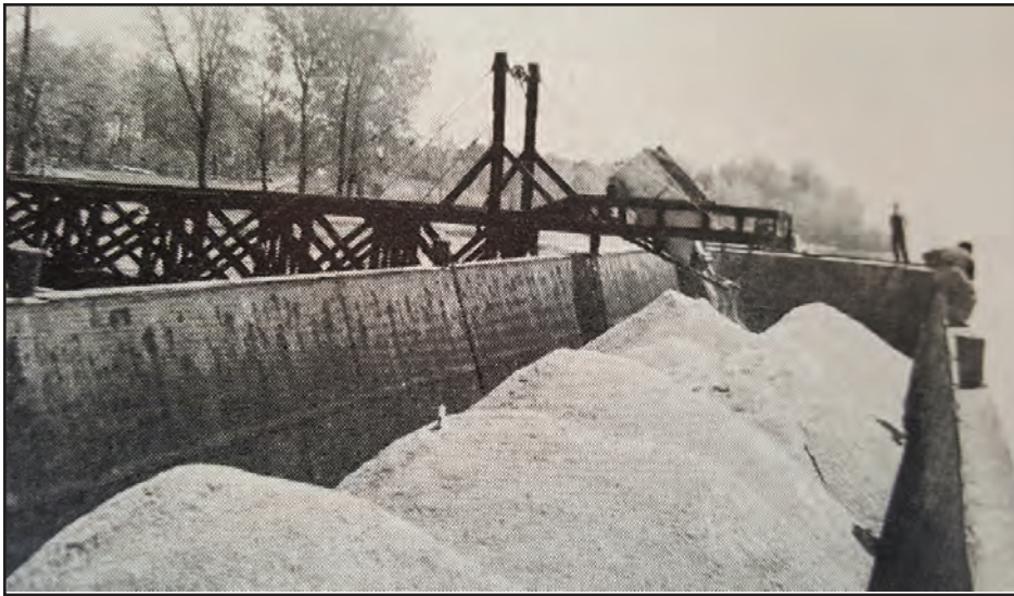
The Crystal Fluorspar Company relied on this Ohio River loading facility to market its product. Barges were capable of carrying up to 550 tons each. This load may be headed to steel mills in Pittsburgh; Granite City, Illinois; Gary, Indiana, or elsewhere.

as lead, zinc, calcite, barite, quartz, and so on. Family mines too small to own the appropriate cleaning technology generally sold their ore to larger mines in the immediate area.